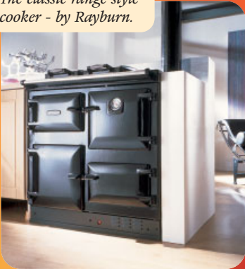
The classic range style cooker - by Rayburn.