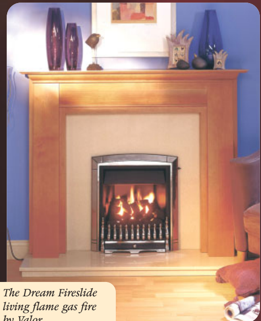
The Dream Fireslide living flame gas fire by Valor.

REMEMBER, THE REAL COST OF A HEATING SYSTEM IS THE ANNUAL FUEL COST - NOT ITS INSTALLATION COST!